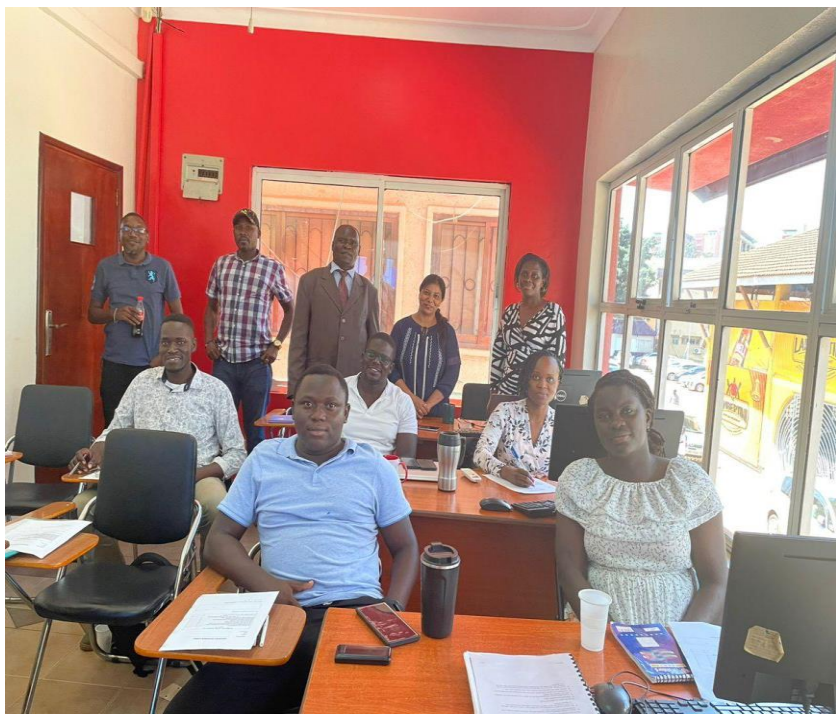
APRIL 2023 Batch