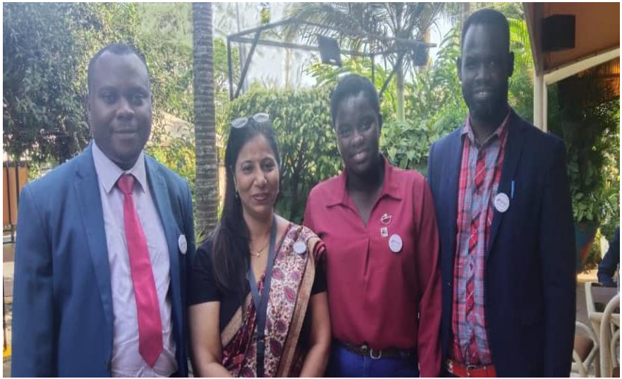
PAU BATCH April 2024